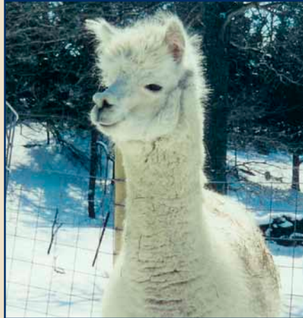
Home of Hummer

Blue ribbon winner at the Big E 2000, son of '3Peruvian Fortissimo', bevy of blue-ribbon winner. Crusader is herdsire to dark-colored crias, admired for their confirmation and fiber.